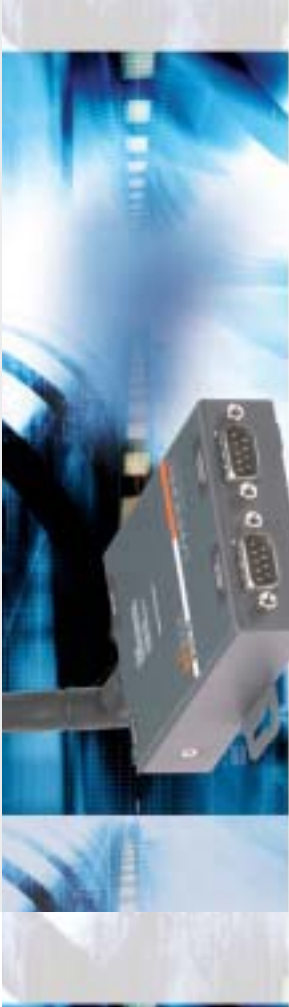
WiBox 2100 Quick Start Guide